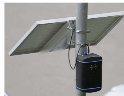
EarthSense monitor & its PV panel

"There are two broad aspects to the plan. One is to try to encourage the use of alternatives to vehicles that cause pollution and the second is to try to keep those vehicles moving steadily.