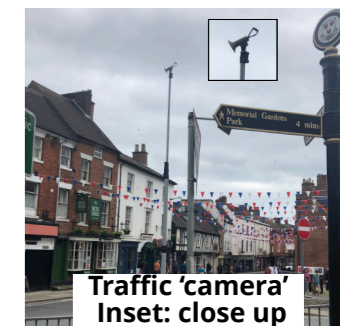
Traffic 'camera' Inset: close up