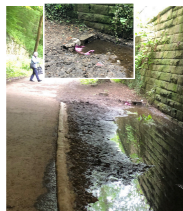
The mystery puddle and inset, the repaired drain.

The large puddle at the tunnel entrance was deterring many users of the Tissington Trail. Volunteers, working with Sustrans who own the trail, have put in a drain and a low 'wall' to confine the water and help it to drain away.