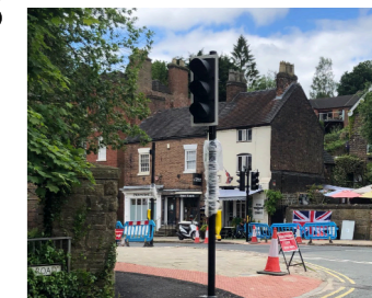
New traffic lights at Church St / Station Rd

Action There is still much going on behind the scenes as preparations for the building phase of the Reborn scheme continue. However the wait is almost over and once the Ashbourne Festival has taken its final bow then more obvious signs of activity should become apparent. Do look out for meetings that will explain the schedule and the extent of any disruption. It is possible that Fishpond Meadow overflow car park will be used as the storage compound for the contractor for the public realm improvements.