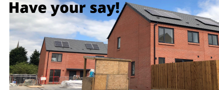
New homes nearing completion in Mayfield Road

The Local Plan is a key document in deciding what gets built where. The Lib Dem led District Council is committed to building thriving and sustainable communities throughout the Derbyshire Dales. The Local Plan is one of the instruments it will use to do so.